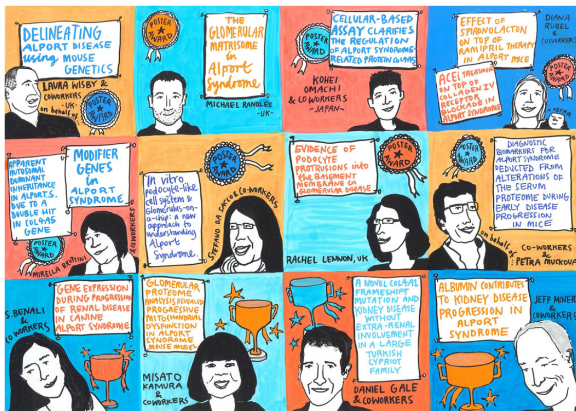
FIGURE 2: Poster prizes and young investigator awards of the 2015 International Workshop on Alport Syndrome.

AS is a disease of families, often with multiple affected family members. Research into the psychological aspects of every stage of the disease course is needed, including support at diagnosis and transition from paediatric to adult providers. Research is also needed on how to support individuals and families through stages of hearing loss, CKD, dialysis, transplantation and family planning. Participants agreed that psychosocial support is generally lacking for all children and adults with CKD and that this should be an area of research focus in the nephrology community. Quality of life measures should be included in any clinical trials for AS. As AS is a rare disease, diagnosis-specific resources are most likely to be useful when provided remotely via the internet, ideally translated into several languages. Several Alport patient advocacy groups have developed their own methods for patient and family support. The Alport Syndrome Foundation (USA) offers both public and private Facebook pages offering advice and fellowship. The Italian Alport association has started a project on ‘recognize Alport syndrome’ on its webpage and distributed a number of informative brochures in key Italian centres. Alport UK have launched a study with University of Oxford to document personal experiences of living with the AS. The videos